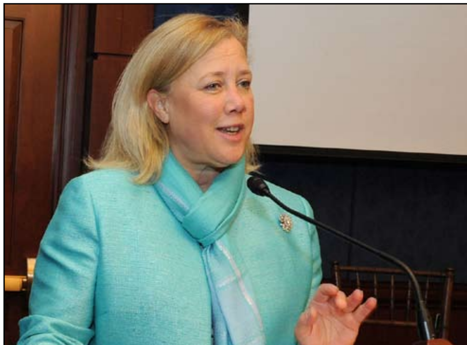
Chair of the Senate Small Business Committee Senator Mary Landrieu wants to ensure small businesses have a chance to succeed