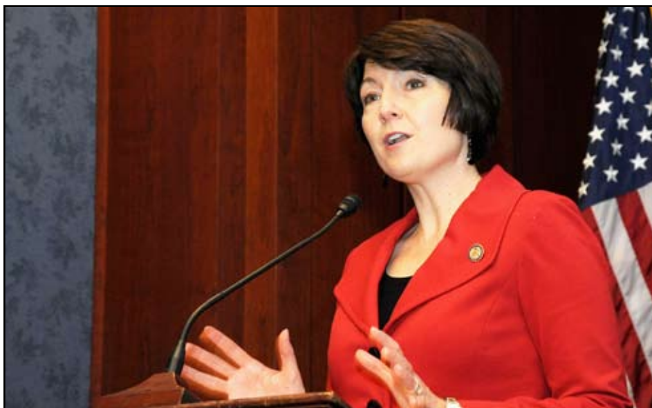
Congresswoman Cathy McMorris Rodgers champions American entrepreneurs in her remarks

H he went on to cite the 2011 Index of Economic Freedom, an annual report published by the Heritage Foundation, which ranks every country in the world by their level of economic freedom, from property rights to entrepreneurship. According to the report, the United States has slipped in recent years. "We're now behind Canada, and dropping from what they term an 'economically free society' to a 'mostly free society,'" lamented the congresswoman.